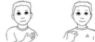
3. and of the Holy 4. Spirit.